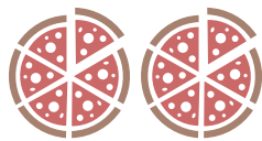
(2) 18" pies EDO 2136*